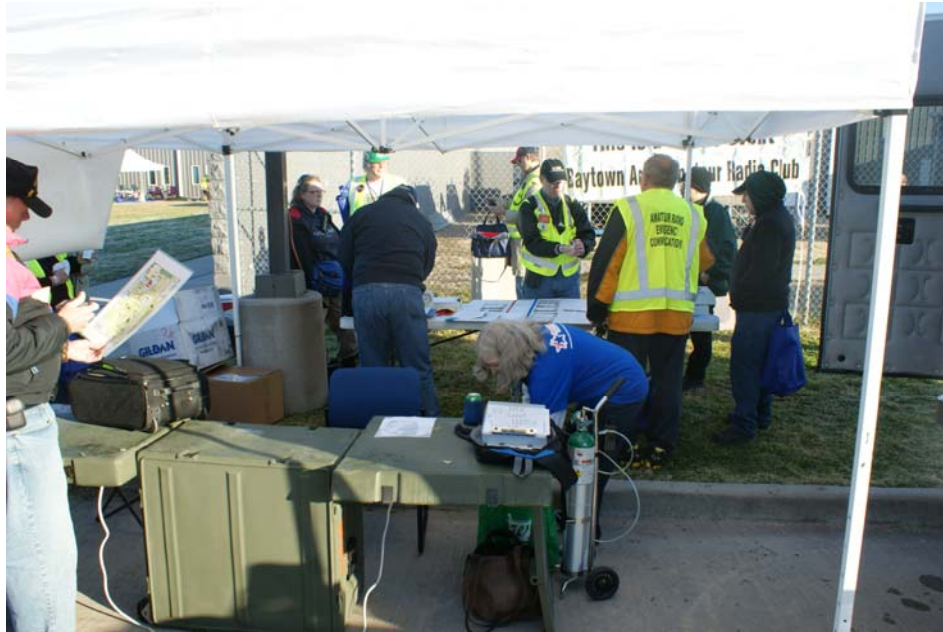
ARES provided communication for the entire event.

CERT Team participants represented 42 teams from the around region and state: Autumn Run, Baytown/Chambers County, BayCERT, Bayfront, Briar Meadow; Brazoria County, Cy Fair, Coles Crossing, Copperfield, Copperfield-Middlegate, Copperfield-Northmead, Cypress Meadow, City of Dallas, Fairfield/Cypress, Fort Bend County, Galveston County, Hearthstone, Jefferson County, LDS Spanish, Lakewood Church, Longwood, NW Deseret, Oakwood Glen, Orange County, Rowlett Explorer Post 1, Sunny Side/South Park, Spring Creek Forest, Seabrook, SeaCERT, Shady Oaks, Shady River, Shore Acres, Stone Creek, Sugar Mill, The Colonies, Tomball Fire Department, Village of Bear Creek, Village at Lake Pointe, Westcreek, Woodland Trails, and Yaupon Ranch.